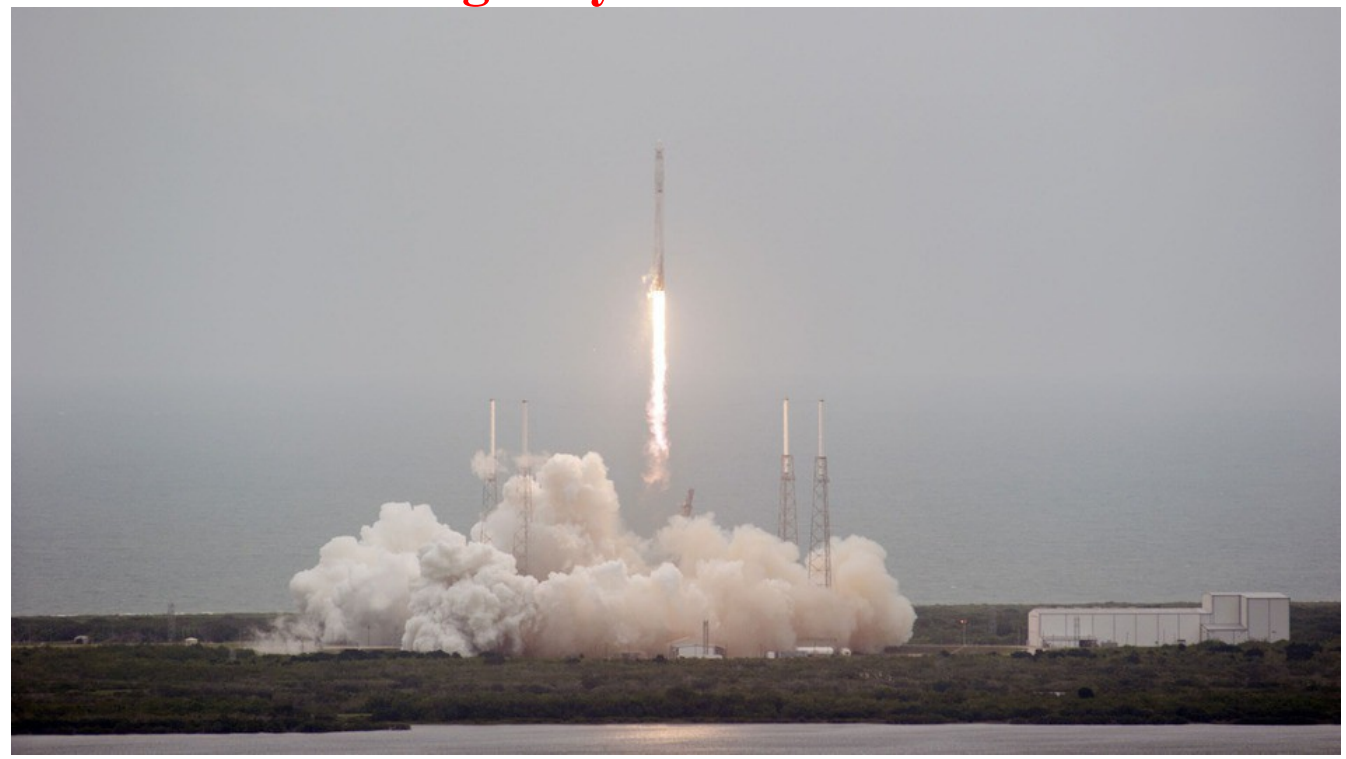
Space X Falcon 9 rocket launch April 18th