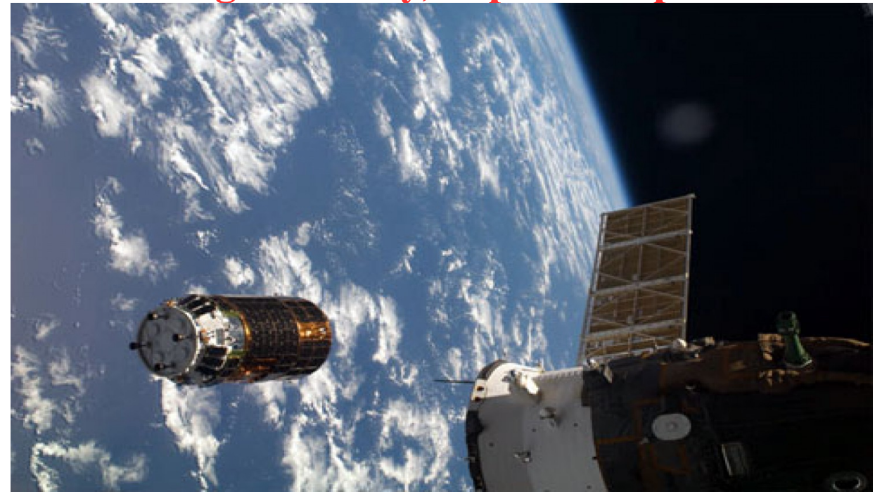
CALET arrives at the ISS. For more information, click on the image above.

Next Meeting: Monday, Sept. 14th 7pm at HRPO